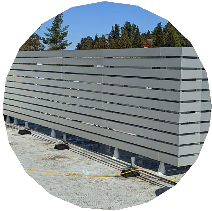
ROOFTOP MECHANICAL EQUIPMENT SCREEN